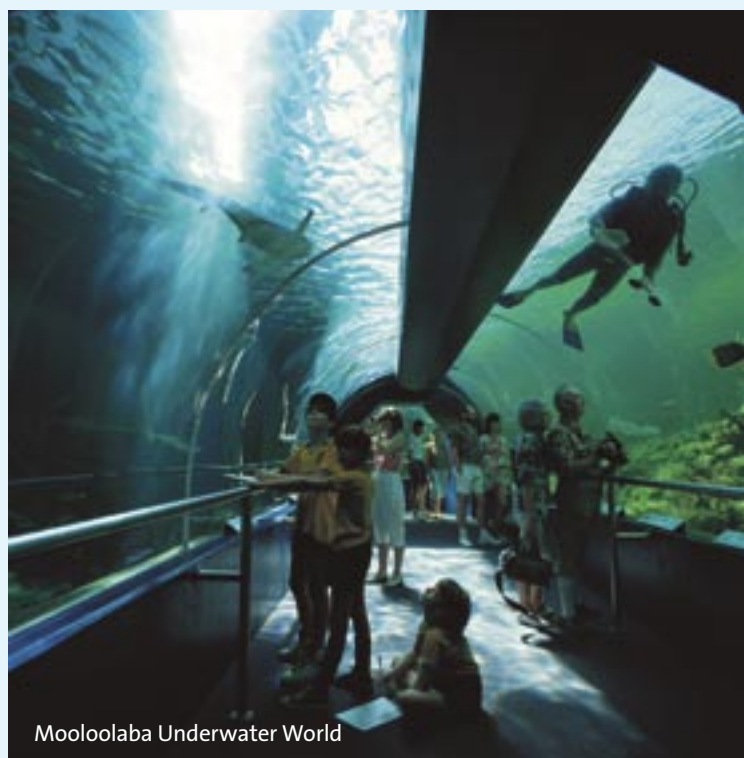
Mooloolaba Underwater World

After such a flurry of activity you'll appreciate Noosa's mild side. Have your rough spots scrubbed with a spa treatment